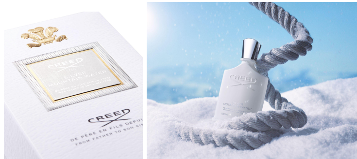
Creed's Silver Mountain Water

Experience the joy of reliving cherished memories of Hari Raya with Creed's exquisite perfumes, including their latest addition to the collection - Silver Mountain Water. This fresh and contemporary scent is inspired by the crispness of alpine air and the purity of cascading alpine streams, a bracing landscape where the Creed family finds relaxation and renewal. Take a trip to their store to find the perfect perfumes that will bring out your inner confidence this Raya!