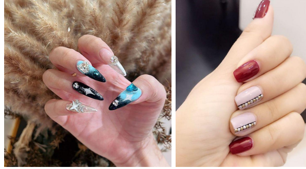
Nail art designs by Nana Nails Express (Left) and Jo Nails (Right)

Don't miss out on the perfect finishing touch for your festive look! Get a perfect set of well-manicured claws at Nana Nails Express or Jo Nails . Choose from a wide range of colours and designs to match your Raya ensemble and pamper yourself with a relaxing mani-pedi session.