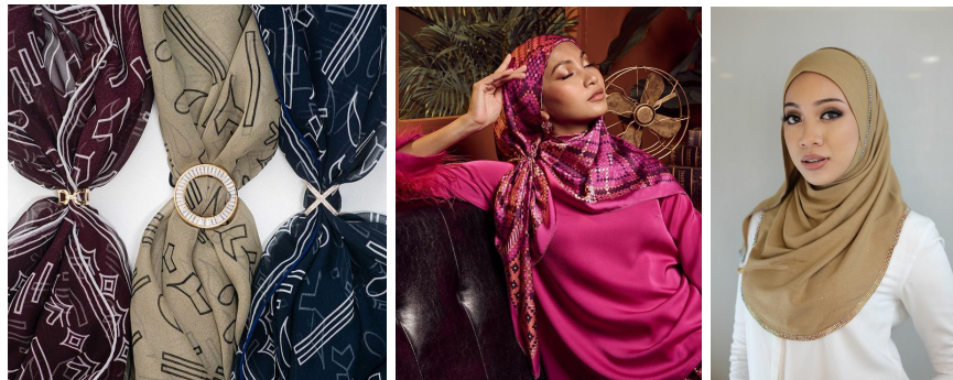
Arzu's scarf rings (Left), The dUck Store's Ikatan dUck collection (Middle), BACARAT's scarf (Right)

Raya isn't complete without finding the best scarves to complement your baju raya - and Arzu , The dUck Store , and BACARAT have the best designs on offer during this season of generosity. Pop by their stores and let your scarves be the star of your Hari Raya outfit, styled to perfection with a wide range of accessories to further enhance your glam factor.