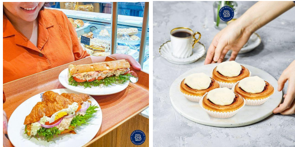
Paris Baguette's sandwiches (Left) and Cream Cheese Cinnamon Swirl Bun (Right)

During this busy month, it can be a challenge to find time to sit down for a proper meal - but that doesn't mean you have to sacrifice enjoying delicious food. Head to Paris Baguette for a quick iftar on the go and indulge in their range of fresh pastries, bread, and cakes. Don't miss their Ramadan promo of 6 items for RM38, available from 3 pm onwards!