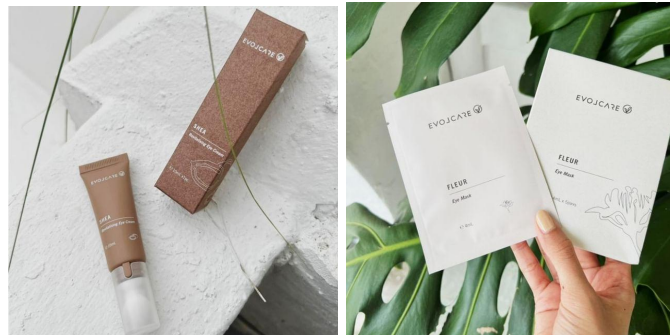
Evolcare's "Shea" Revitalising Eye Cream (Left) and "Fleur" Eye Mask (Right)

Everyone's worst nightmare during Hari Raya is a botched beef rendang - but a close second is a last-minute breakout! Fortunately, Evolcare's got your back! Their skincare line will help you achieve a radiant, healthy glow just in time for the festivities. For the ultimate pampering, try their Biotics Series Mask Set, featuring four masks that purify, hydrate, and brighten your skin, leaving you with a flawless complexion.