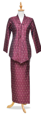
Jovian's Raya collection (Left) and Ceemboja's kebaya (Right)

Looking for the ultimate Raya outfit? Jovian and Ceemboja have got you covered - literally! With stunning Raya collections, these retailers are the go-to option for anyone wanting to look their best and make a statement this Hari Raya!