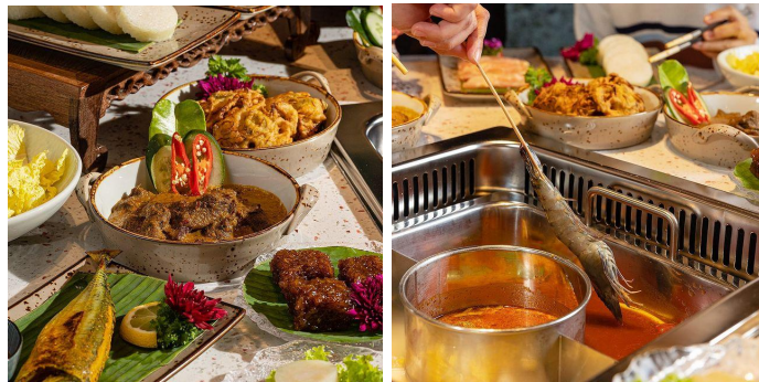
RasaNya Steamboat's Ramadan buffet