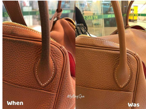
My Bag Spa's colour restoration process

Revive your leather shoes and handbags just in time for Raya with My Bag Spa ! Our expert hand-cleaning process will restore your well-loved favourites to their former glory. Say goodbye to dull and faded colours and hello to a fresh and vibrant look that will make you stand out. Don't let your cherished leather accessories gather dust in your closet, give them the TLC they deserve this Raya season!