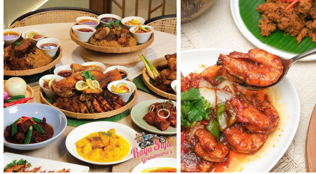
Grandmama's Nasi Dulang Bukhari sets (Left) and Homemade Tomato Chili Prawns (Right)

From the warm and welcoming decor to the homely signature dishes, everything at Grandmama's screams comfort food. Try the Nasi Dulang Bukhari, a mouth-watering dish bursting with flavour and perfect for sharing with your loved ones. Grandmama's Ramadan menu offers an authentic Malaysian experience that will stir up feelings of nostalgia and leave you feeling right at home.