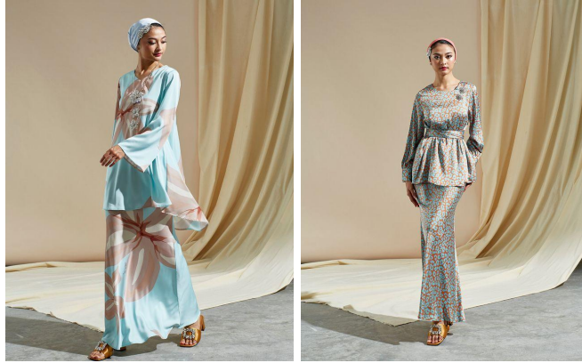
Variante's Najma Baby Blue Flower Printed Blouse & Skirt (Left) and Waqia Turquoise Printed Blouse & Skirt (Right)

Leave your Raya guests breathless with Variante's luxurious "Memory Raya" line. Whether you're looking for something simplistic or eye-catching, Variante has got your back with its range of modest fashion wear with inclusive sizes up to a women's 48! So, get ready to elevate your fashion game this Hari Raya!