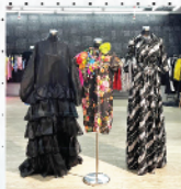
MODA Fashion Gallery Lot 1-37-39, 1st Floor