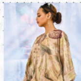
Nurimancraft Lot 1-46, 1st Floor