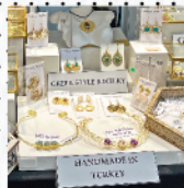
Exotic Gifts Lot 1-52, 1st Floor