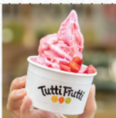
Tutti Frutti Lot G-43 (01 & 02), Ground Floor