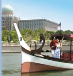
Cruise Tasik Putrajaya