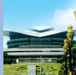
Putrajaya International Convention Centre