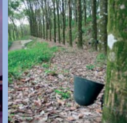
Taman Warisan Pertanian