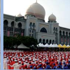
Palace of Justice