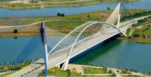
Seri Saujana Bridge